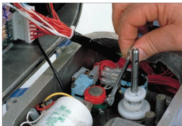
Torque switch setting